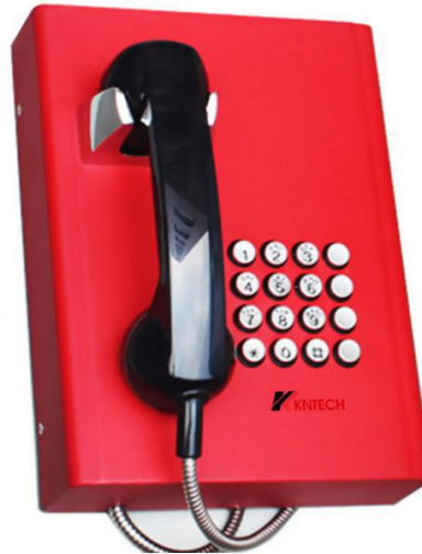
VoIP KNZD-27 Wall Mount Telephone